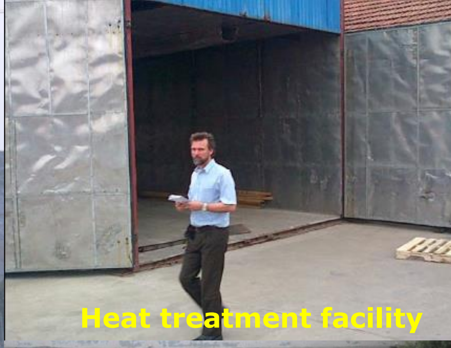
Heat treatment facility